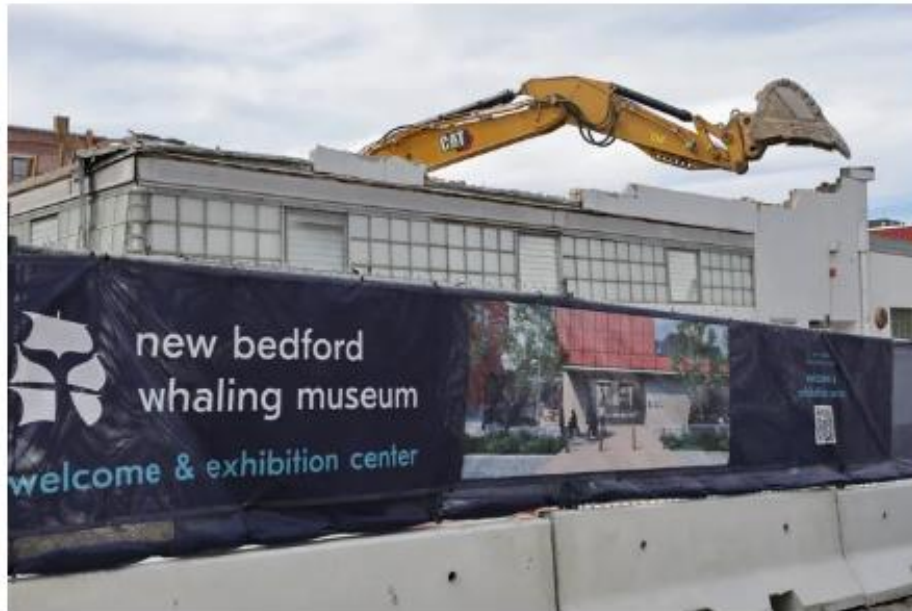
An excavator arm prepares to rip down the wall of the former Hiller Building on William Street in New Bedford making way for the construction of the new Whaling Museum Welcome & Exhibition Center.