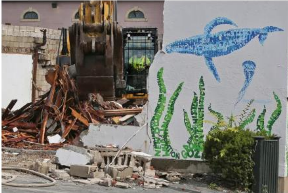
The excavator operator is seen demolishing the wall featuring a series of whale themed murals. Demolition has started on the former Hiller building opposite the New Bedford Whaling Museum, making way for the construction of the new Welcome & Exhibition Center.