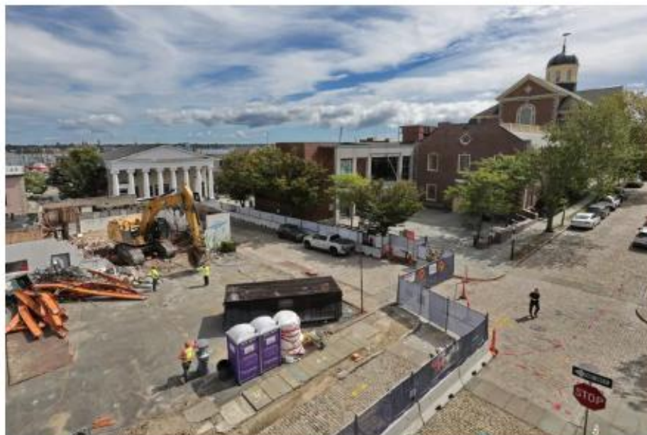
A man walks across William Street in New Bedford. Demolition has started on the former Hiller building opposite the New Bedford Whaling Museum, making way for the construction of the new Welcome & Exhibition Center.