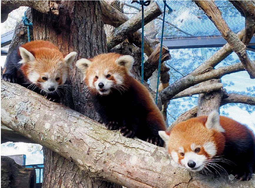
Buttonwood Park Zoo helps preserve red pandas, an endangered species.