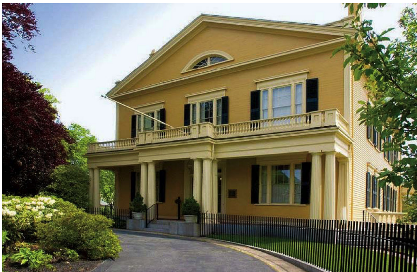
The Rotch-Jones-Duff House offers 150 years of history, and its rose garden blooms into the fall.