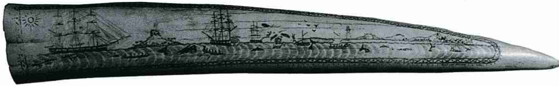
“SACHEM.” Simulated walrus tusk, length 16 inches (40.6 cm). Juratone #105MTW, Fakeshaw #89.