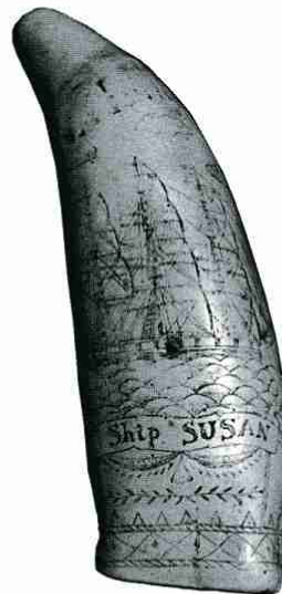
“SUSAN.” Simulated whale tooth, produced in at least two different sizes: 7 inches (17.75 cm) (Juratone #108TH) and 5.5 inches (14 cm) (Grooveport #SJ12). Fakeshaw #107a and b.