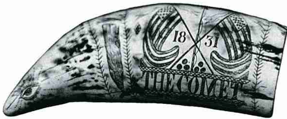
“COMET.” Simulated whale tooth, manufactured in at least two different sizes. Juratone #116TH, Grooveport #SJ30, Fakeshaw #22.