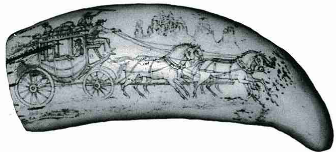
Similar stagecoach pictures appear on three different simulated whale teeth: “STAGECOACH (Wild West),” “STAGECOACH (Turnage),” and “EL PASO, TEXAS” ( Fakeshaw #102, 187, 136).